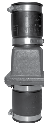
30-0151 Cast Iron