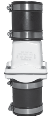
30-0021 Pvc Plastic

Consult Factory or local representative for state approvals